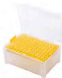
Last Drop Low Retention Pipette Tips, Sterile Racked