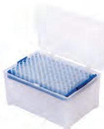
Last Drop Low Retention Pipette Tips, Racked