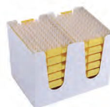
Last Drop Low Retention Pipette Tips, Refill Pack

* For additional product or technical information, please visit www.abdoslabware.com . For distributor information contact labtech@abdosindia.com .