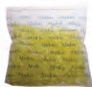
Last Drop Low Retention Pipette Tips, Bulk in Resealable Bags

* Abdos range of Pipette Tips Racked for more details please visit us at www.abdoslabware.com/low-retention-pipette-tips.html