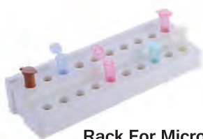
Rack For Micro Centrifuge Tube

* Abdos range of Micro Centrifuge Tubes Racks for more details please visit us at http://abdoslabware.com/centrifuge-ware.html