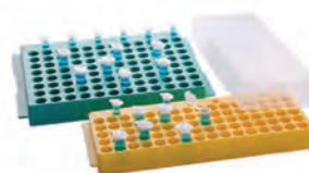
Reversible Rack with Cover

* For additional product or technical information, please visit www.abdoslabware.com . For distributor information contact labtech@abdosindia.com .